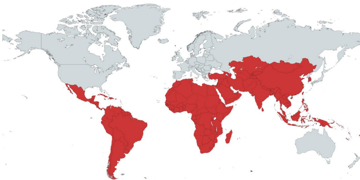
Figure 1 This map displays in red the LMICs that were eligible for inclusion in this study based on the United Nations classification by income and development. 15 LMICs, low-income and middle-income countries.

assessed for similarities and differences between studies in each thematic area.