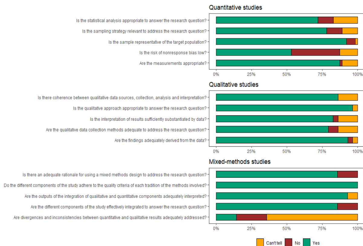
Supplementary Figure 1a: Methodological quality of the included primary studies based on the five core criteria for each study design using the the Mixed Methods Appraisal Tool (MMAT)

Note: Percentages represents the proportion of studies within each study type that were scored "yes", "no" or "cant tell". There were 52 quantitative studies, 31 qualitative studies, and 24 mixed methods studies.