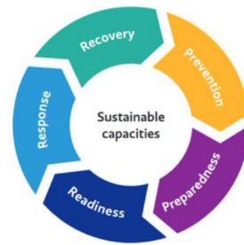
Figure 1 Full emergency management cycle.

The WHO, among other organisations, states that managing health crises requires actions throughout multiple phases. 11 These phases are captured in the emergency management cycle (EMC) and typically consist of: prevention, preparedness, response and recovery. The