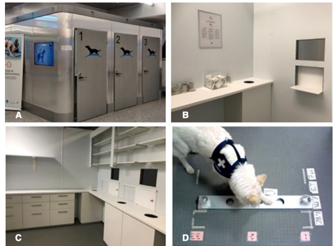
Figure 1 The purpose-built cubicle at the Helsinki-Vantaa International Airport. (A) The cubicle from the outside with the doors into the three sampling rooms. (B) Sampling room with a hatch for handing in the sample for the scent detection dog test. (C) A room for scent detection dog testing, showing two of the three hatches to the right. (D) White Shepherd, E.T., inside the test room, indicating the sample in the middle (No 2) as positive. During the validation, only three of the five scent track holes had cans with samples.

At the Helsinki-Vantaa International Airport, the study was conducted in a specifically designed cubicle