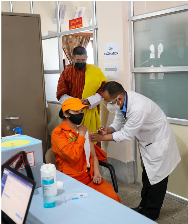
Figure 2 King Jigme Khesar Namgyel Wangchuck (centre) has travelled the length and breadth of the country to guide national efforts against the COVID-19 pandemic. Featured, the King witnessing vaccination at Monggar district, east Bhutan at the launch of the nationwide COVID-19 vaccination programme.

inspiration, encouragement and overall guidance in mitigating the damage caused by this pandemic (figure 2).