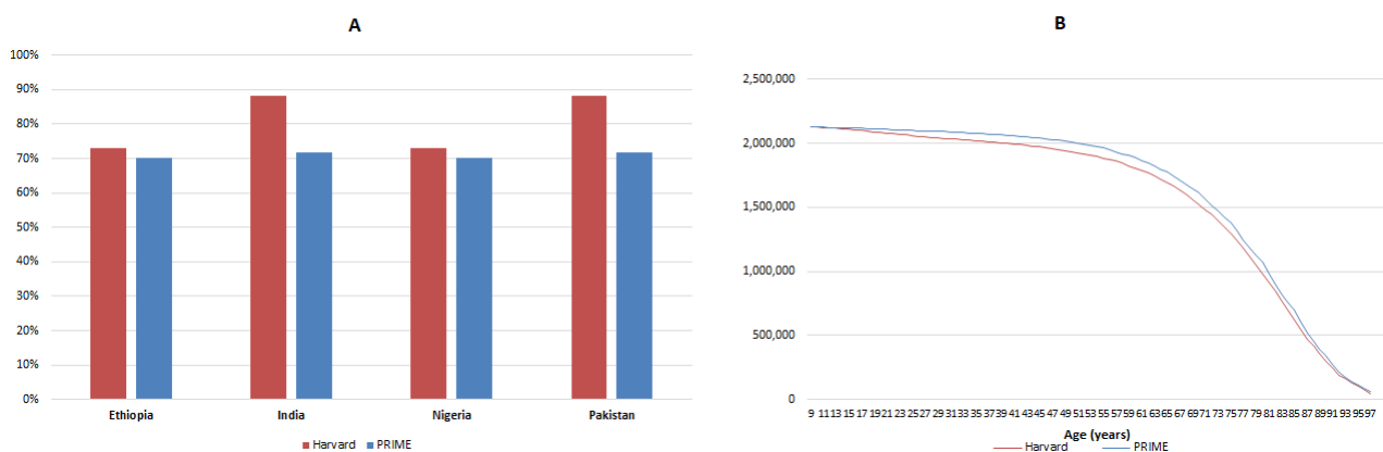
Figure 1 (A) Proportion of cervical cancer attributable to HPV-16/18; and (B) population size over time for 9-year-old girls born in 2012 (vaccinated in 2021) in Pakistan. HPV, human papillomavirus; PRIME, Papillomavirus Rapid Interface for Modelling and Economics.

Under different assumptions for HPV-16/18-type distribution and demography, the Harvard model estimated a greater number of cervical cancer cases averted than the PRIME model by 3% in Ethiopia, 20% in India, 2% in Nigeria and 19% in Pakistan (figure 2A). Specifically, the range between the PRIME model and the Harvard model for the potential health impact of HPV vaccination in terms of the number of cervical cancer cases averted among girls vaccinated in 2021–2030 between the year of vaccination and 2100 was: 262 000 to 2 70 000 in Ethiopia; 1 640 000 to 1 970 000 in India; 330 000 to 3 36 000 in Nigeria and 111 000 to 1 33 000 in Pakistan.