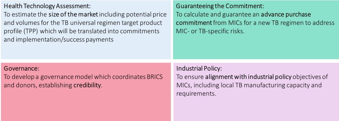
Figure 2 Market-driven, value-based advance commitment. SDG, Sustainable Development Goal; TB, tuberculosis.