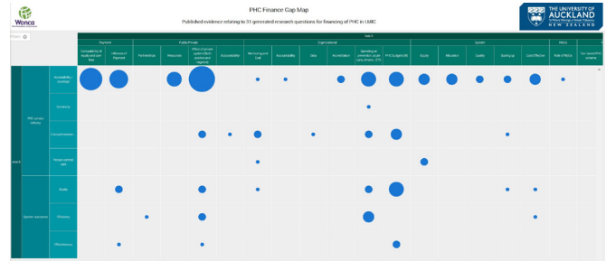
Figure 3 Static copy of gap map. PHC, primary healthcare.

being developed by the World Bank. A static version is shown in figure 3. An interactive web-based map was also generated (Gap Map finance) which presents both heat-map and bubble-map versions, includes filters for LMIC and for global regions, and enables viewing of all studies in a cell by clicking on the bubble.