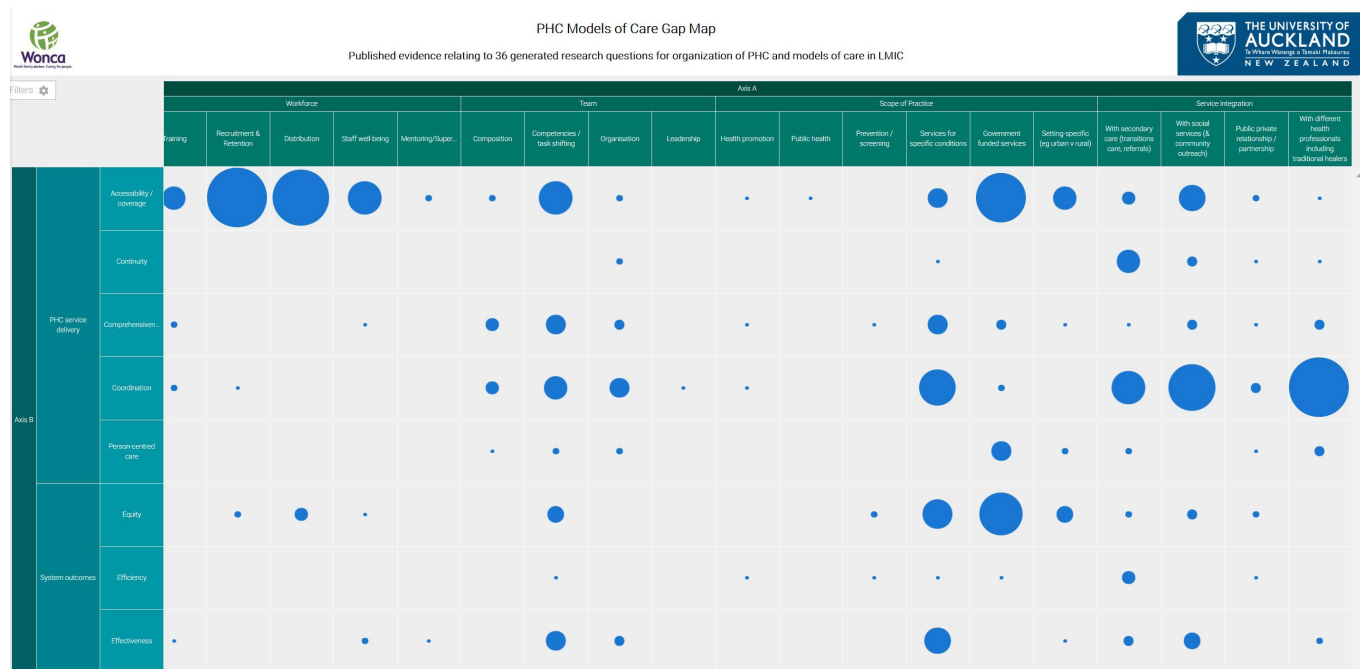
Figure 3 Static version of gap map of studies for model of care.

question were coded for two axes. Seven global regions (Europe, Eastern Mediterranean, Asia Pacific, South Asia, Africa, North America, South America) and a list of all LMICs were included as filters for the map.