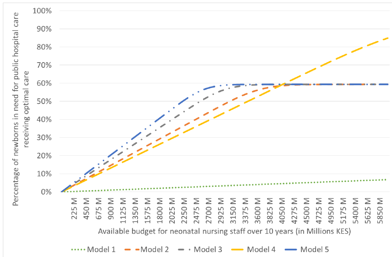
Figure 1 Effective coverage of newborns by level of budget (KES) for neonatal nursing staff. The curves of models 2, 3 and 5 flatten at some point because these models assume current levels of coverage irrespective of budget level. KES, Kenyan Shillings.

5) if the available budget for neonatal nursing staff costs over 10 years is around 3 billion KES (US$30 million). Above that budget level, the authorities should consider expanding the levels of neonatal care coverage while keeping the quality of care at optimal levels.