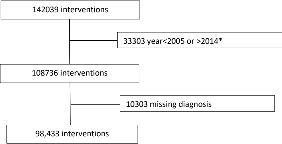
Supplemental Figure 1. Flow chart