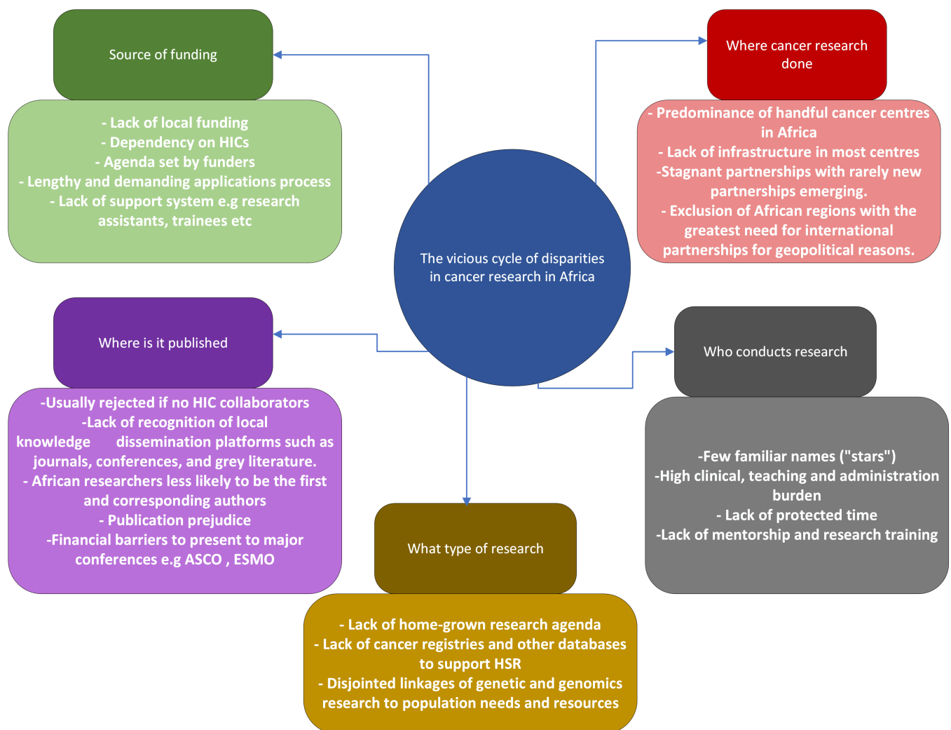
Figure 1 The vicious cycle of disparities in Africa's cancer research ecosystem. ASCO, American Society of Clinical Oncology; HIC, high-income country; ESMO, European Society for Medical Oncology; HSR, Health Service Research.

Current disparities in cancer research in Africa can be attributed to a vicious cycle of challenges in the research