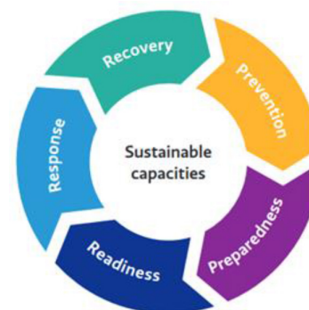
Figure 1 Full emergency management cycle.

The WHO, among other organisations, states that managing health crises requires actions throughout multiple phases. 11 These phases are captured in the emergency management cycle (EMC) and typically consist of: prevention, preparedness, response and recovery. The