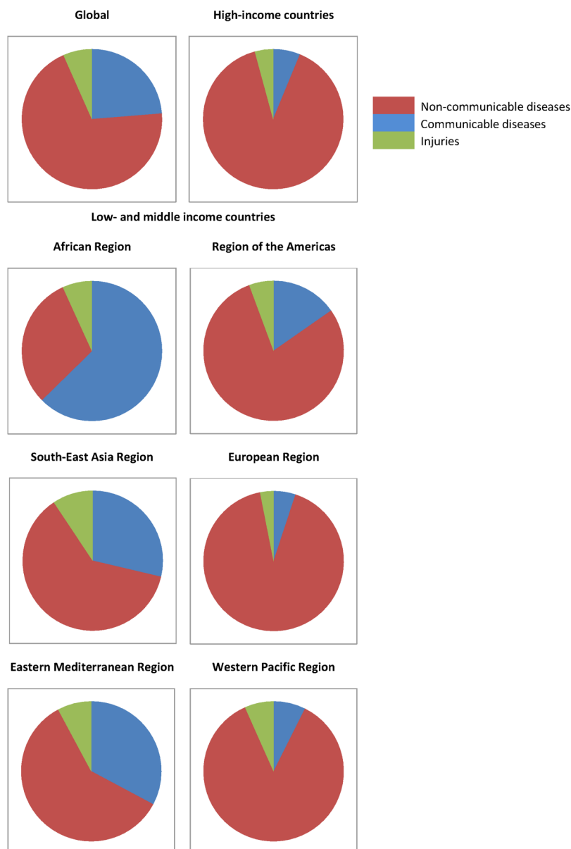
Figure 1 Deaths from non-communicable diseases, communicable diseases and injuries among women in 2012, by the World Bank income category and the WHO region. Data were obtained from the Global Health Estimates 2014 Summary Tables. 2 List of World Bank income categories and WHO regions: high-income countries : Andorra, Antigua and Barbuda, Australia, Austria, Bahamas, Bahrain, Barbados, Belgium, Brunei Darussalam, Canada, Chile, Croatia, Cyprus, the Czech Republic, Denmark, Estonia, Equatorial Guinea, Finland, France, Germany, Greece, Iceland, Ireland, Israel, Italy, Japan, Kuwait, Latvia, Lithuania, Luxembourg, Malta, Monaco, the Netherlands, New Zealand, Norway, Oman, Poland, Portugal, Qatar, Russian Federation, Saint Kitts and Nevis, San Marino, Saudi Arabia, Singapore, Slovakia, Slovenia, South Korea, Spain, Sweden, Switzerland, Trinidad and Tobago, the United Arab Emirates, the UK, the USA, Uruguay; African region : Algeria, Angola, Benin, Botswana, Burkina Faso, Burundi, Cabo Verde, Cameroon, Central African Republic, Chad, Comoros, Congo, Côte d'Ivoire, Democratic Republic of the Congo, Eritrea, Ethiopia, Gabon, Gambia, Ghana, Guinea, Guinea-Bissau, Kenya, Lesotho, Liberia, Madagascar, Malawi, Mali, Mauritania, Mauritius, Mozambique, Namibia, Niger, Nigeria, Rwanda, Sao Tome and Principe, Senegal, Seychelles, Sierra Leone, South Africa, Swaziland, Tanzania, Togo, Uganda, Zambia, Zimbabwe; region of the Americas : Argentina, Belize, Bolivia, Brazil, Colombia, Costa Rica, Cuba, Dominica, Dominican Republic, Ecuador, El Salvador, Grenada, Guatemala, Guyana, Haiti, Honduras, Jamaica, Mexico, Nicaragua, Panama, Paraguay, Peru, Saint Lucia, Saint Vincent and the Grenadines, Suriname, Venezuela; South-East Asia region : Bangladesh, Bhutan, India, Indonesia, Maldives, Myanmar, Nepal, North Korea, Sri Lanka, Thailand, Timor-Leste; European region : Albania, Armenia, Azerbaijan, Belarus, Bosnia and Herzegovina, Bulgaria, Georgia, Hungary, Kazakhstan, Kyrgyzstan, Montenegro, Moldova, Romania, Serbia, Tajikistan, Macedonia, Turkey, Turkmenistan, Ukraine, Uzbekistan; Eastern Mediterranean region : Afghanistan, Djibouti, Egypt, Iran, Iraq, Jordan, Lebanon, Libya, Morocco, Pakistan, Somalia, South Sudan, Sudan, Syria, Tunisia, Yemen; Western Pacific region : Cambodia, China, Cook Islands, Fiji, Kiribati, Lao, Malaysia, Marshall Islands, Micronesia, Mongolia, Nauru, Niue, Palau, Papua New Guinea, Philippines, Samoa, Solomon Islands, Tonga, Tuvalu, Vanuatu, Viet Nam.