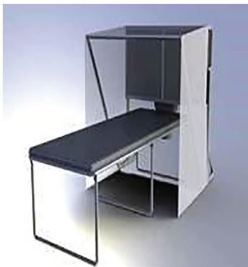
Figure 1 Ventilated headboard. The ventilated headboard consists of lightweight, sturdy and adjustable aluminium framing with a retractable plastic canopy. It is fitted with a high-efficiency particulate air fan/filter unit for filtration (adapted from Mead 48 ).

viruses at homes and in the healthcare settings in LMICs. Moreover, HCWs in LMICs face other challenges that limit optimum infection control including shortage of good quality PPE, variable knowledge on the appropriate use and maintenance of PPE, rapidly evolving policies and lack of proper infrastructure. 50 In the context of the global COVID-19 pandemic, it is essential to conduct further operational research to develop robust evidence to support decision-making and planning by healthcare managers, clinicians and the wider population. Several research questions that could inform policy-makers include: (1) What are the rates of infection transmission in settings with suboptimal versus optimal ventilation? (2) Is the adoption of the hybrid approach effective in reducing the transmission of infections in LMICs? (3) What can be done to maintain thermal comfort in hospital units and makeshift tents without increasing the risk of the transmission of infection? The design of these research projects would benefit from multidisciplinary teams including architects, surveyors, engineers, IPC practitioners and clinicians.