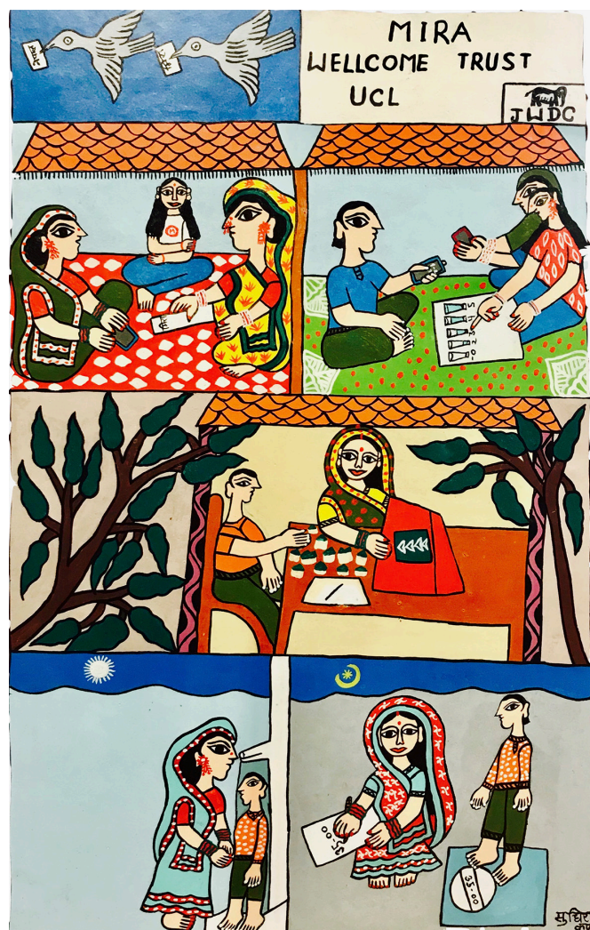
Figure 1 Mithila painting depicting consent taking, interviewing, and a child participating in the Universal Non-verbal Intelligence Test, Stroop test and anthropometry.

hindering children's chances in school and contributing to the intergenerational transmission of poverty. 5-9