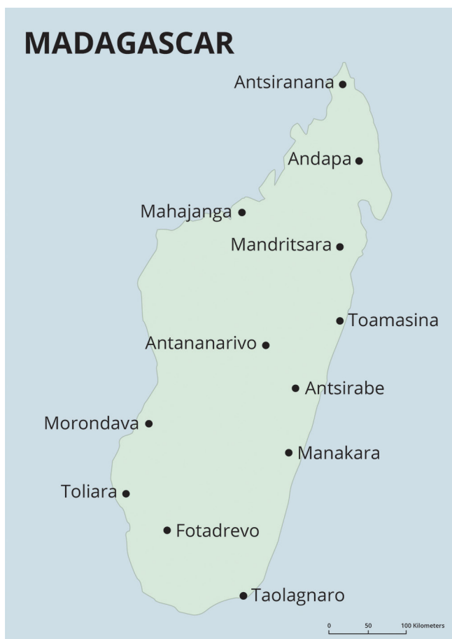
Figure 1 Map of Madagascar showing location of cities used in centralised and decentralised selection strategies.

other barriers still exist, such as distance, transport costs and health literacy. Deliberate patient selection strategies aimed to target the financially poor, those living in remote areas and to overcome gender disparities are needed, but it is unclear whether such strategies are sufficient to overcome these barriers.