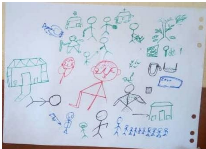
Figure 1 Rich picture of participants' knowledge and perceptions of non-communicable disease conditions (in red), their causes (in blue and black) and the places they go to seek help (in green).